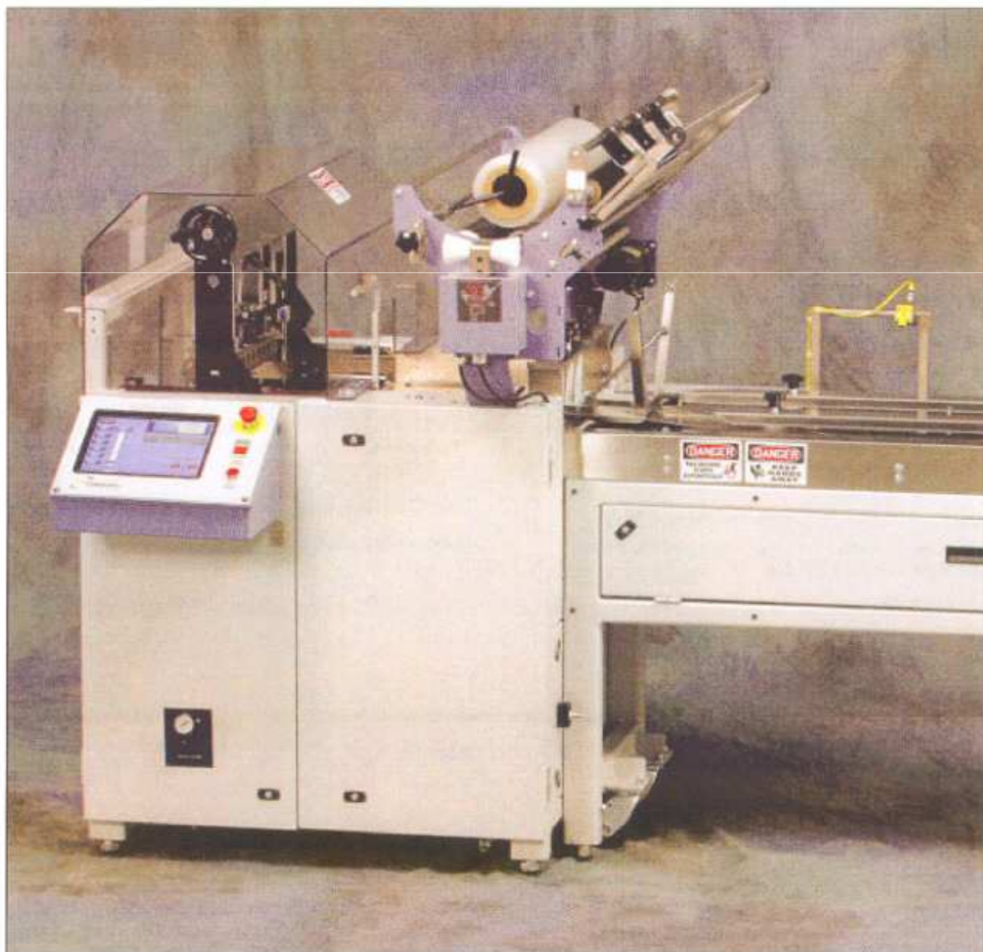
ServoFlex modular shown

Innovative Design Incorporates Servo Technology for the Ultimate Performance and Flexibility