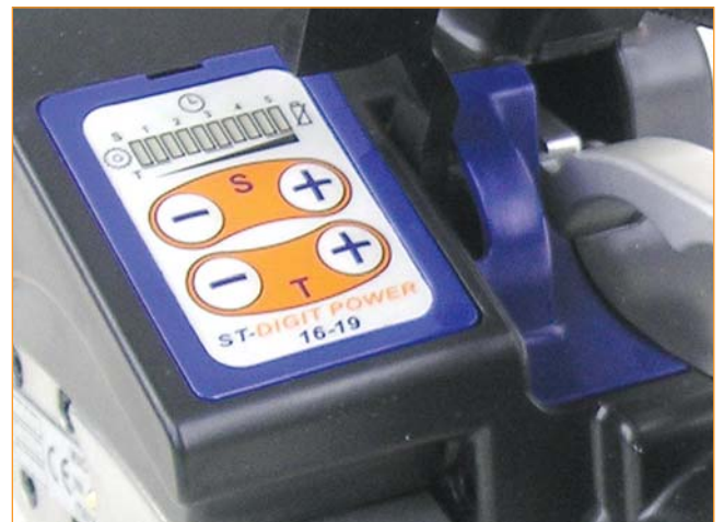
New digital adjustment system for tension and sealing time